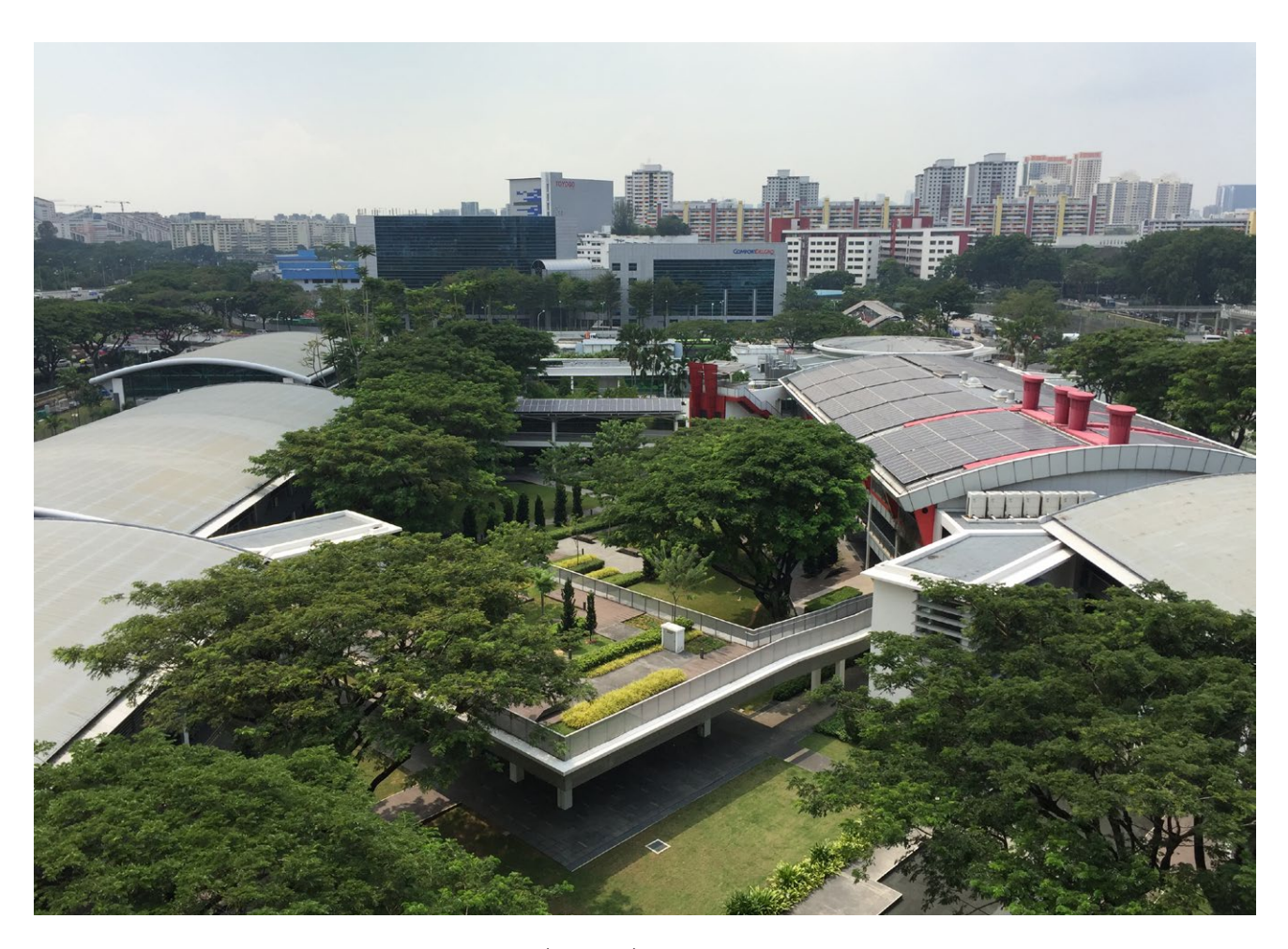
Figure 3: BCA Academy Campus with Zero Energy Building (right side)

Engage occupants to reduce wastage of energy.