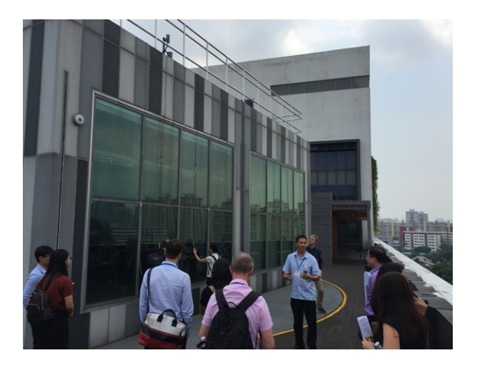
Figure 2: BCA Skylab

Lack of understanding of technologies and increasing complexity of technologies affects purchasing decisions, installation, operations and maintenance. Complex systems with customized parts possess challenge to