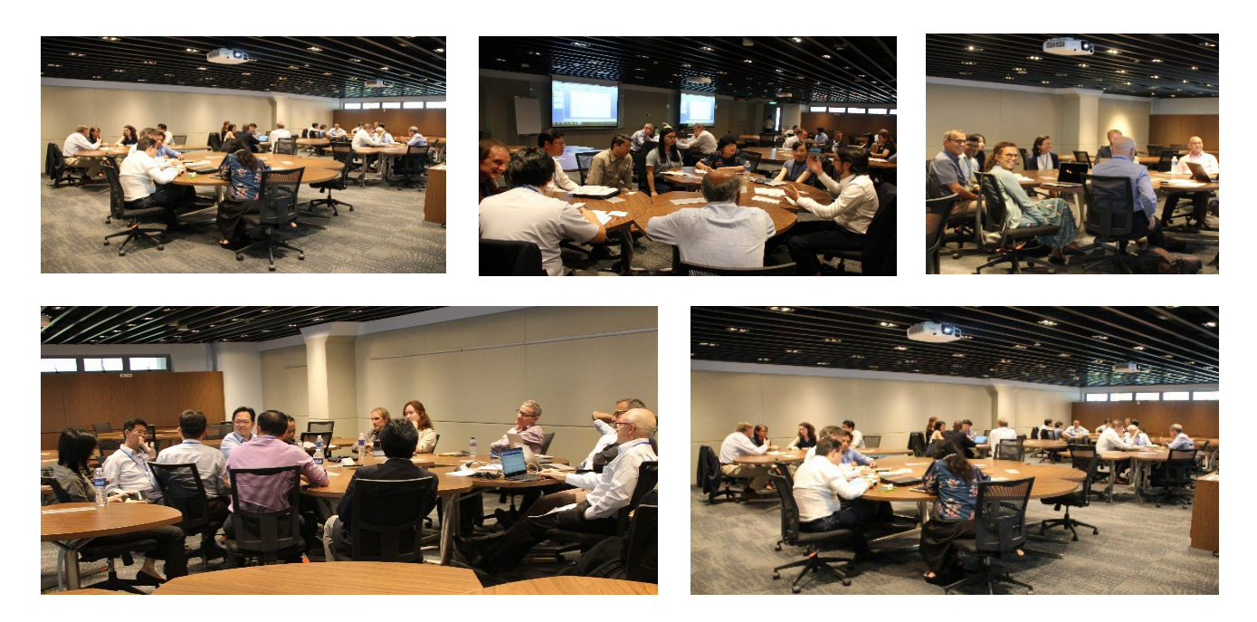
Figure 6: Impression from parallel sessions

Very little information on evidence of energy and nonenergy benefits. The multiple benefit studies of the IEA prove there are many more options for financing if these multiple benefits are taken in consideration. The European Union started a Horizon 2020 project on this topic. Evaluation of energy policies in general could be stronger. We all know good examples, but need statistical evidence to prove the points made