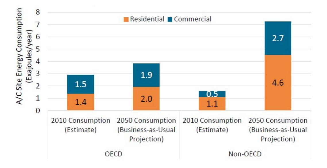
Figure 4: Current and projected space cooling site energy consumption

Advanced Vapour-Compression Systems: AC technologies that significantly lower refrigerant GWP and energy consumption while maintaining cost-