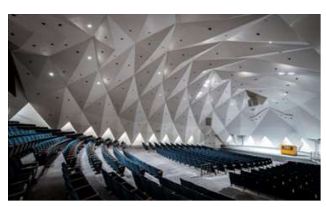
The National Academies of SCIENCES • ENGINEERING • MEDICINE