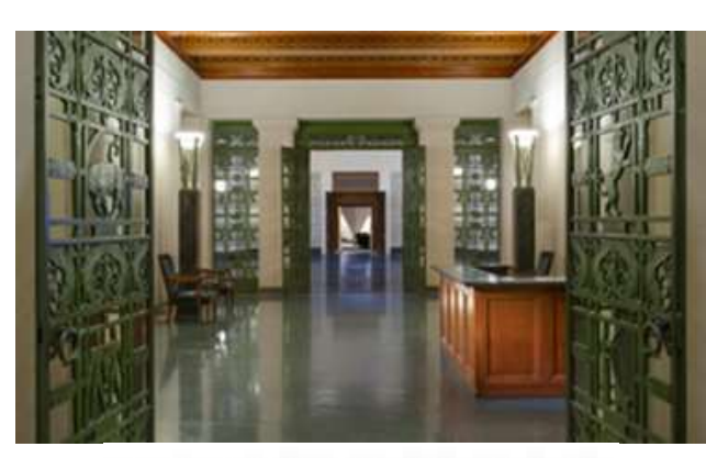
FEDERAL FACILITIES COUNCIL