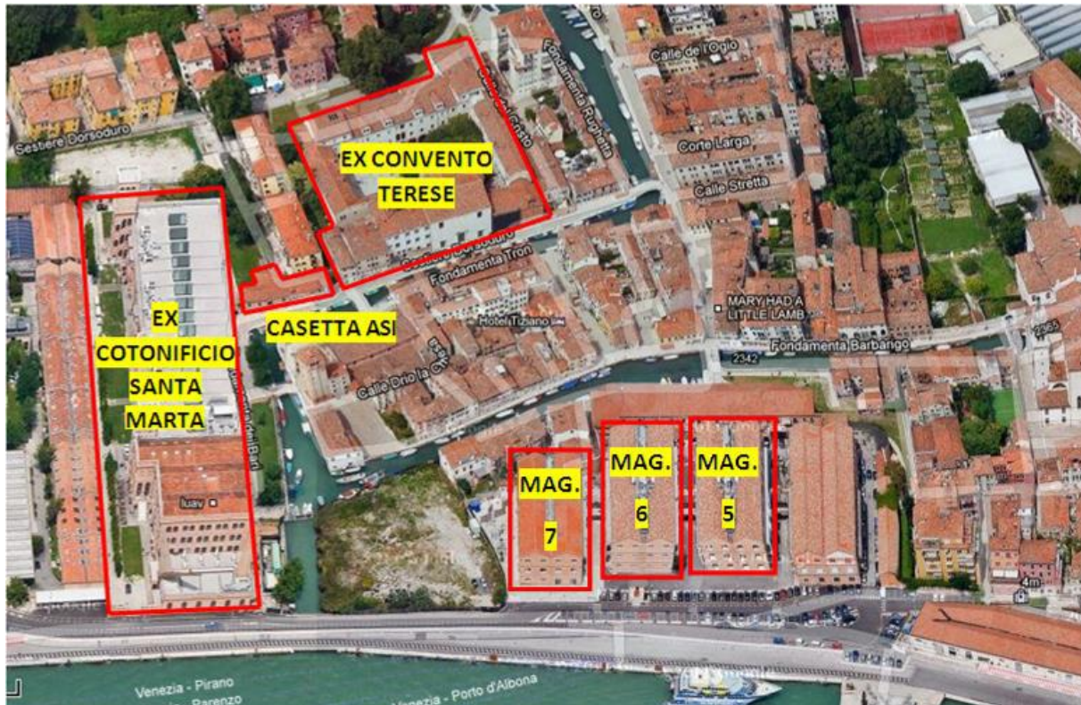
Figure 1. Location of Santa Marta Campus in Venice (red square)

In the university campus of Santa Marta in Venice all buildings are schools except a caretaker's house, the property is the University Luav of Venice for a total volume of about 104,000 m 3 and about 17,500 m 2 of heated floor area.