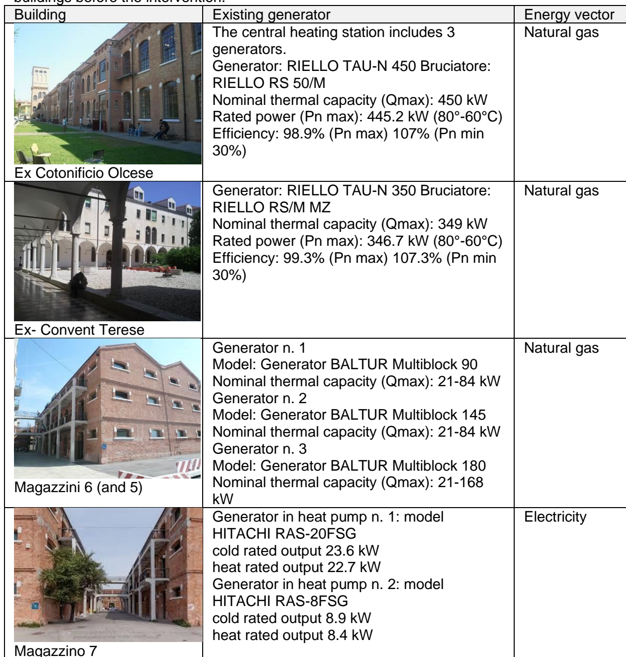
Table 1. Characteristics of the heating stations and energy vectors for each university buildings before the intervention.

There is no use or generation of renewable energy on-site, but the characteristics and orientation of the roof in the Ex-Cottonificio are potentially usable for the installation of a photovoltaic system.